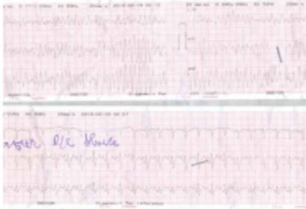
Figure 1: ECG at the time of presentation & after Direct Current (DC) cardioversion

however, it was reported that one of the first degree cousins of the patients had sudden death of unknown cause at 11 years of age.